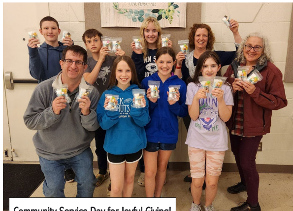
Community Service Day for Joyful Giving!