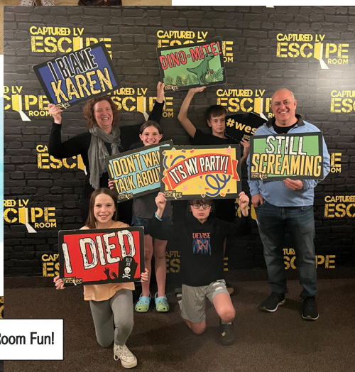
Escape Room Fun!